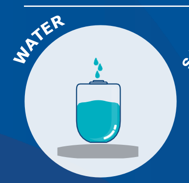
1. Fill the bottle with water to the line