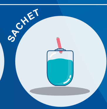
2. Drop the soap sachet into water