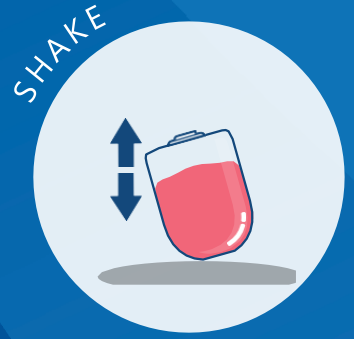
3. Shake the container. Wait 30 seconds