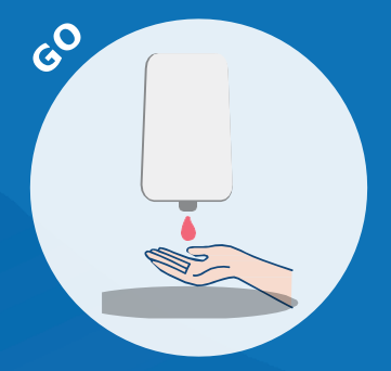
4. Ready to go!