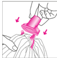
Fit mop head into socket