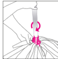
Secure socket with handle