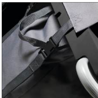
Easily Detachable Laundry Bags