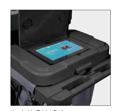
Lockable Tablet Option