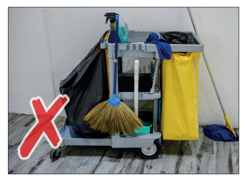
Poor selection and configuration lowers cleaning standards and productivity.

Nu-Design guides you through the product configuration process, providing a visual output and configuration breakdown at each selection. The result; a reliable, functional and innovative cleaning system that fits your needs precisely.