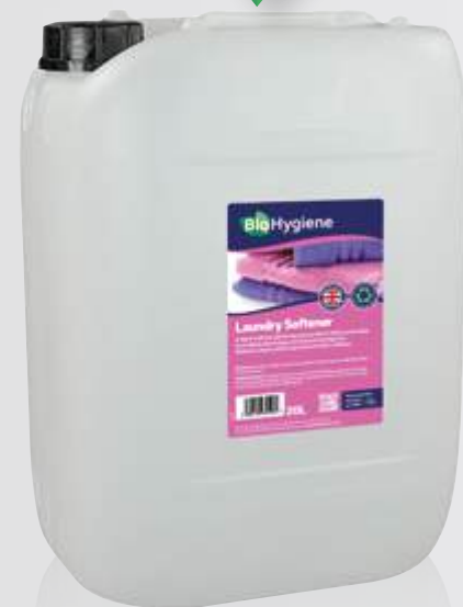
BH242 1x20L Concentrate