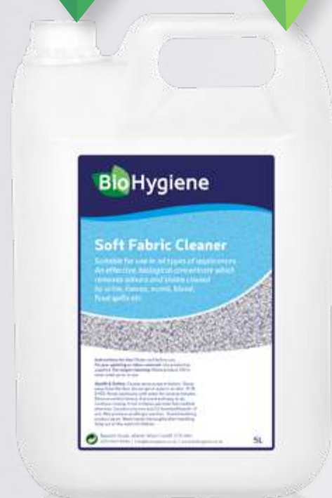
BH017 2x5L Concentrate