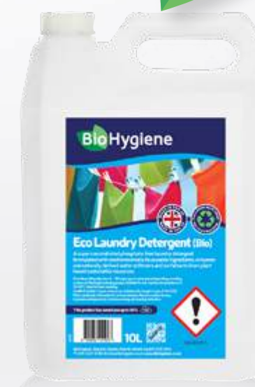
BH124 1x10L Concentrate

A powerful destainer that makes easy work of removing stubborn stains from white and coloured fabrics. Anti-microbial activity and powerful fragrance boosters leaves fabrics hygienically clean with long-lasting freshness every time.