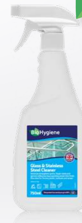
BH134 6x750ml Ready to use