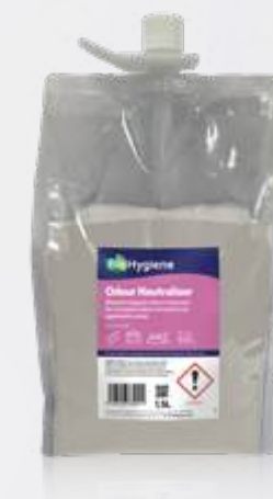
BH266 2x1.5l Dosing pouch

Breathe new life into your glass and steel surfaces with BioHygiene Glass and Stainless Steel Cleaner. The naturally-derived formula quickly cuts through and removes grime, finger marks and general soiling leaving a sparkling streak-free finish.