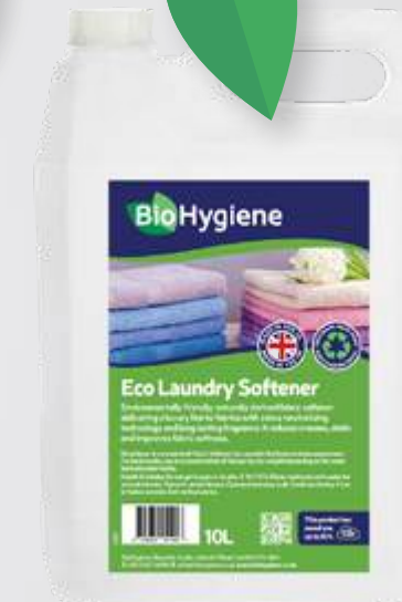
BH249 1x10L Concentrate

BioHygiene Eco Laundry Destainer is an environmentally friendly, water-based destainer offering superior bleaching and deodorising performance along with anti-microbial activity against a wide spectrum of bacteria and fungi.