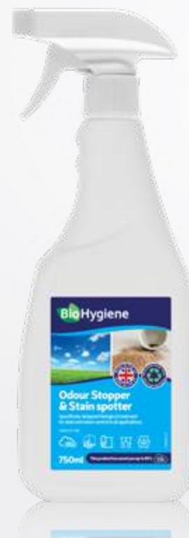
BH043 6x750ml Ready to use

An eco-friendly fabric cleaner formulated from specialist enzymes and microbes that effectively break down dirt, remove stains, and leave fabrics feeling clean and soft. Gentle on all skin types.