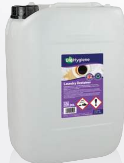
BH234 1x20L Concentrate

A super concentrated, phosphate-free laundry detergent formulated with naturally-derived ingredients with favourable eco-toxicity and health and safety profiles. A highly effective alternative to phosphate with multi-functional benefits.