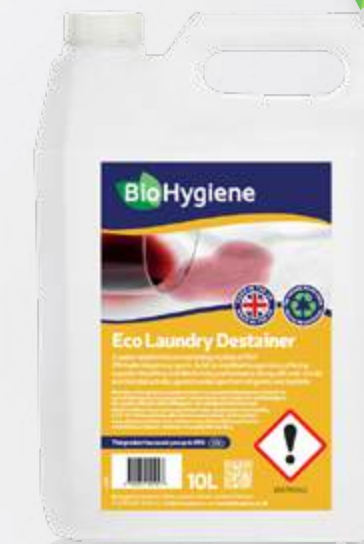
BH247 1x10L Concentrate

BioHygiene Eco Laundry Detergent harnesses the power of enzymes and naturally-derived ingredients to combat tough stains and odours. Experience bright, fresh fabric with long-lasting fragrance whilst reducing your carbon emissions and plastic waste.