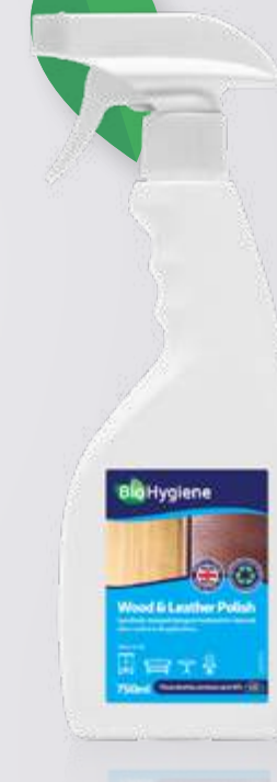
BH162 6x750ml Ready to use