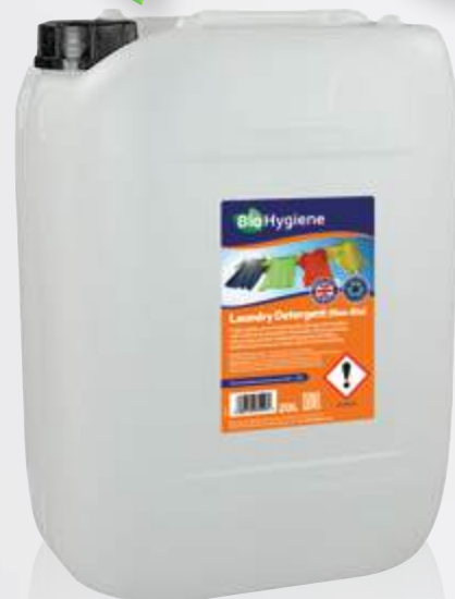
BH179 1x20L Concentrate

BioHygiene Laundry Softener gives fabrics a luxurious softness and fresh scent. Naturally-derived softening and antistatic agents protects fibres while odour neutralising technology eliminates residual odours and provides long-lasting fragrance.