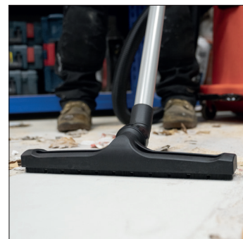
High Efficiency ProFlo Dry Floor Tool