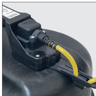
Easy Replacement Plugged Cable System